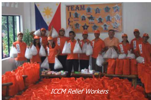
ICCM Relief Workers

This aid is being distributed through the local church so that they can ensure that it is given to the people who actually need it. It is given without prejudice of race or religion. (Protestants seem to often miss out on government relief which seems to be channelled to those of the majority religion in the Philippines.) ICCM distribution is controlled and strictly accounted for.