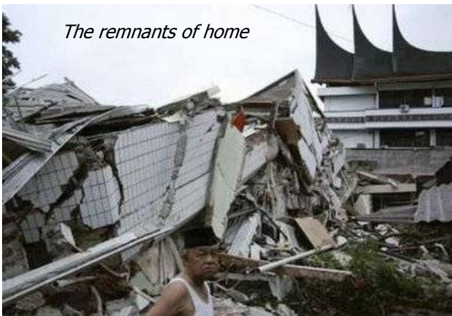
The remnants of home